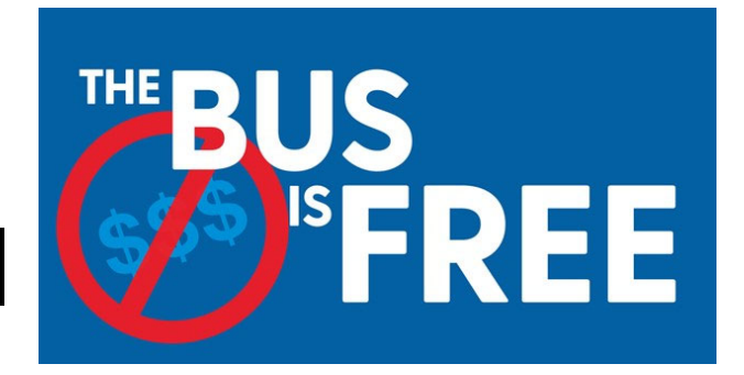
Hele-On is free until December 31, 2025! Just Hop on and Hele-On!