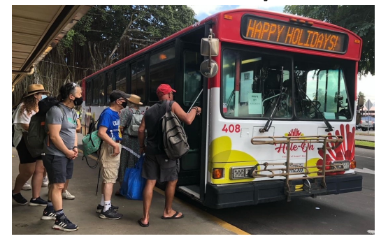
7 day a week service between Downtown Hilo @ Mo'oheau Bus Terminal and Hawai'i Volcanoes National Park

Telephone: (808) 961-8744 TDD/TTY: 711 www.heleonbus.org